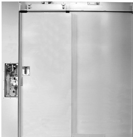
Shown with 1058M Lock and Optional Lock Mounting Pilaster