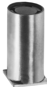
10105R Foot Bolt Receptacle

Note: Shown with cover plates used only with grating and plate doors