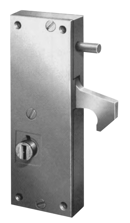
30 Series Deadlatch Right hand shown.