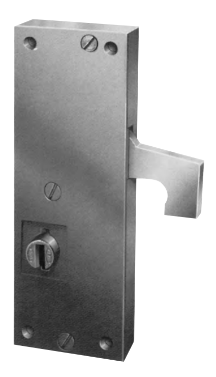
30D Series Deadlock Right hand shown.